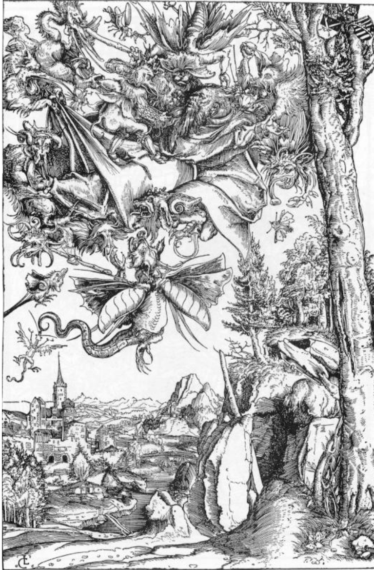
30. The Temptation of St. Anthony. After a design by Lucas Cranach the Elder, 1506.