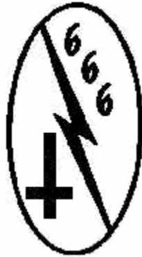
THE SIGIL OF ANTICHRIST

If you truly have a Darkness to your soul then this ritual will be both inspiring and self-fulfilling. However, by the same token, if you're attempting to become something you're not, it can bring forth a demon of self-destruction. Therefore, know thyself!