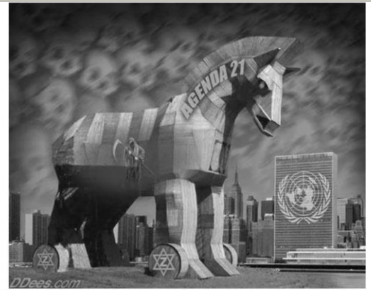
Figure 303: Agenda 21 is indeed a Trojan horse to global fascism

The UN's Agenda 21 sets out guidelines for sustainable development, but Icke wrote in 2010 that its purpose was "to use the excuse of the environment to transform global society."<sup>30</sup> This would later develop into a theory that Zionists planned to use Agenda 21 as "a Trojan horse to global fascism".<sup>31</sup>