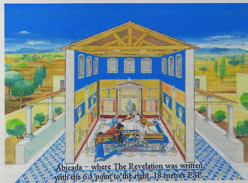
Abicada – where The Revelation was written with the 6:5 point to the right, 18 metres ESE.