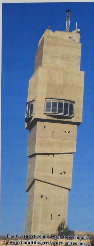
The Castle M. Zion water tower marks 'a weird multilayered story arises here'.

When Hebrews 1:10-12 is written in modern English, it shows the Bible has a viewpoint on Reincarnation: You shall grow old and your body shall pass away, but you endure; Like a cloak, your body is folded away & changed, but you are the same and live on forever in different bodies.