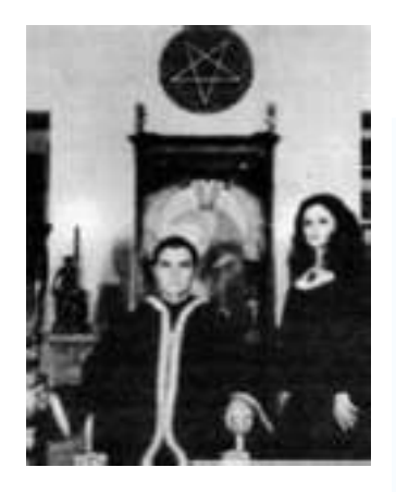
The Aeon of Set