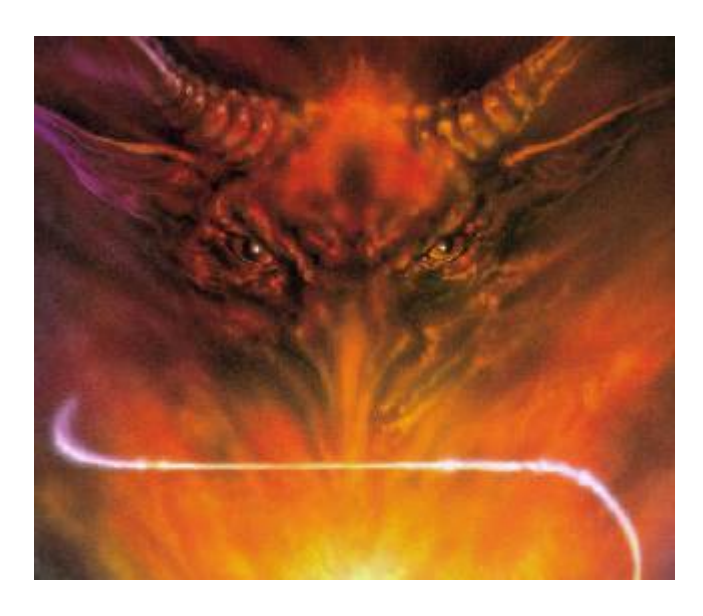
The Demonic Apocrypha Book II of the Demonic Bible Magus Tsirk Susej