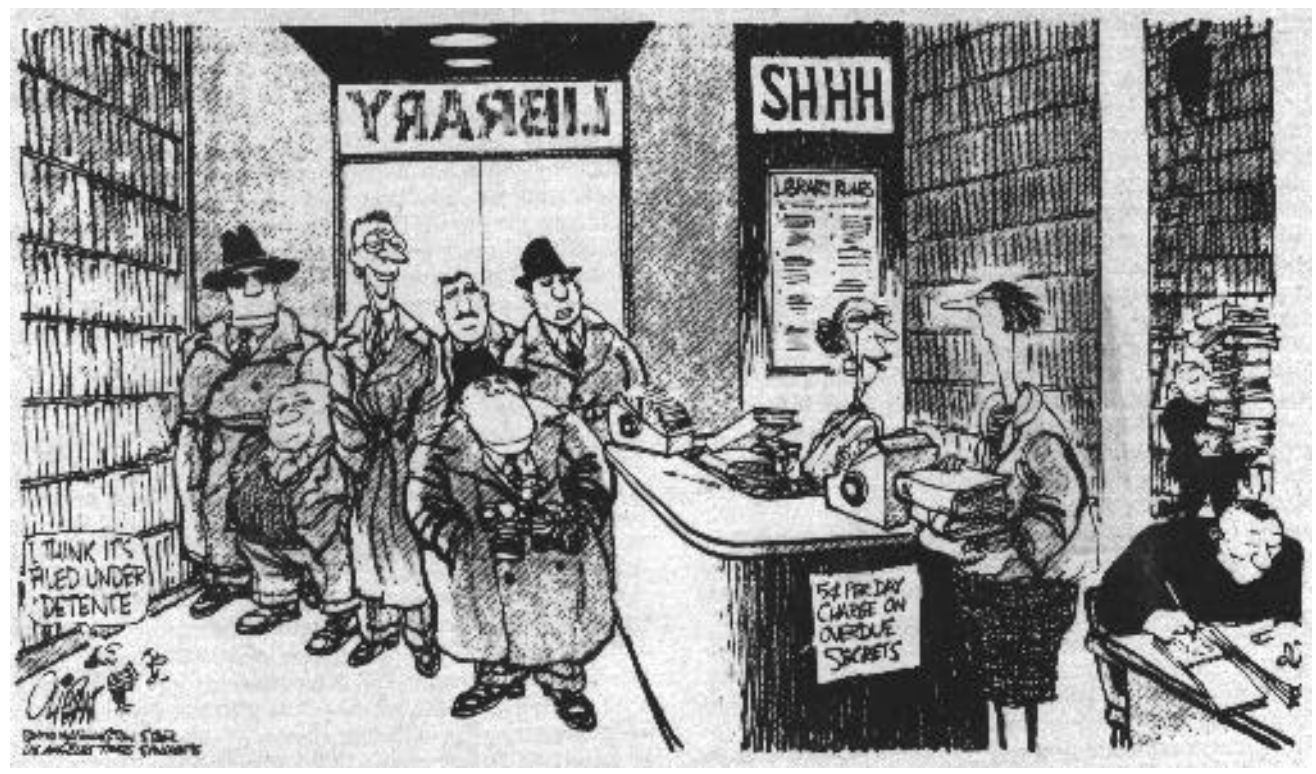
"Miss Clagthorpe, please direct this group of students to 'Weapons, Nuclear (Neutron), Top Secret, Declassified'."